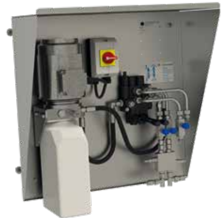
MSE PRO Hydraulic Control Unit