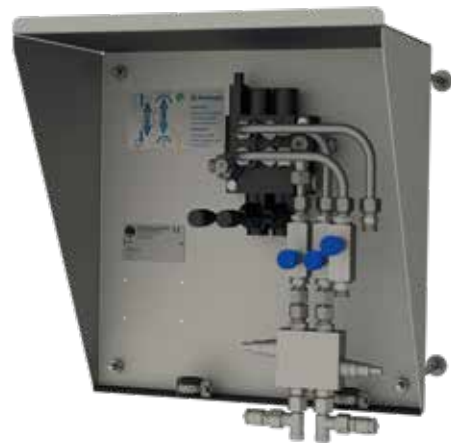
MSE PRO Control Unit