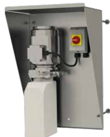
MSE PRO Hydraulic Unit