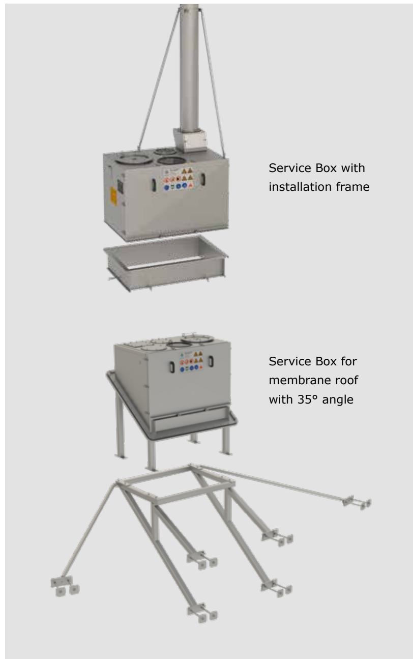
Service Box with installation frame