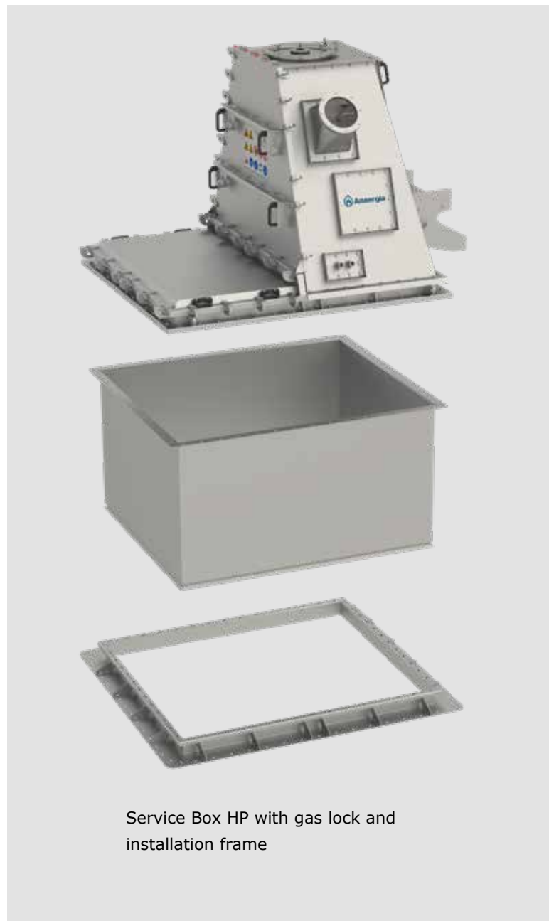
Service Box HP with gas lock and installation frame