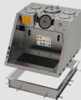
Service Box with installation frame