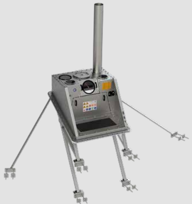
Service Box for membrane roof with 20° angle