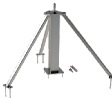
Elevated tripods available in 0.5m and 1m (20inch and 40inch) risers