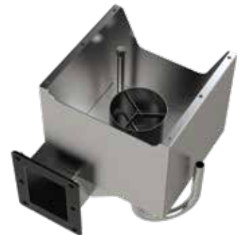
Underpressure safety device